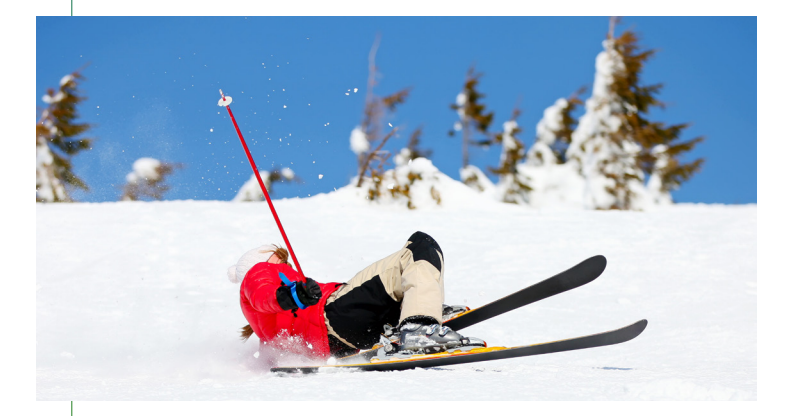
Holding a pole during a fall can cause a skier's thumb injury.

Most often, injuries occur during sport or recreational activities, such as skiing, football, biking and soccer. Any extreme force to the thumb in the opposite direction can cause a sprain or strain, but injuries can also occur as a result of a fall, or jamming the thumb.