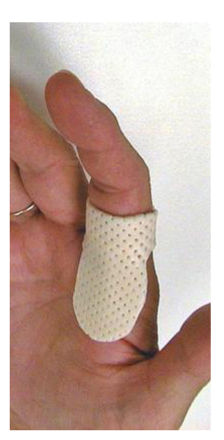
Orthosis for trigger finger

stiffness during the healing process. The hand therapist will also discuss ways to modify activities while the finger is healing. Hand therapy following surgery will improve range of motion, and teach the patient how to regain the function of the hand.