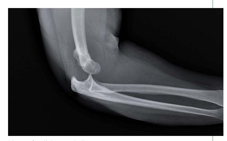
X-ray of a dislocated elbow

A hand therapist will work closely with the surgeon to help treat a terrible triad injury. The hand therapist may make an elbow orthosis to support and protect the elbow. The therapist will also educate the patient on how to reduce swelling, decrease pain and safely improve range of motion and strength of the elbow.