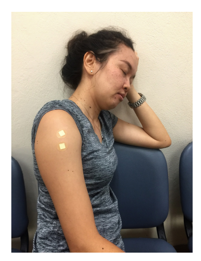
Direct pressure on the arm over a long period of time, such as falling asleep in a chair, can cause radial nerve palsy

Radial nerve palsy may occur as a result of upper arm fractures or direct pressure on the arm over a sustained period of time.