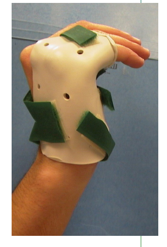
Custom-made orthosis for a hand fracture

A hand therapist is extremely important in the rehabilitation of hand fractures. The therapist can fabricate a custom orthosis that provides proper positioning and allows the fracture to heal. Fingers become stiff very fast, and a hand therapist can instruct the patient in safe exercises that will prevent stiffness. The best outcome after a finger fracture is to have a fully healed fracture with a return of full motion, strength and hand function.