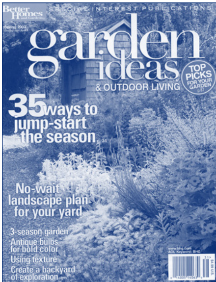
ASHT's "Gardening Tips" were featured in Better Homes and Gardens .

In your practice, you see the results of accurate assessments and treatment made possible through the specialty of hand therapy. Patients experience a shorter treatment time and a faster return to a productive lifestyle. But there are many more patients that need to be reached. By building