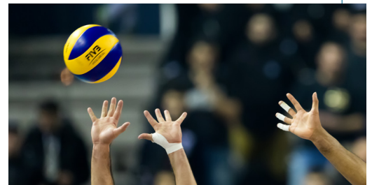
Catching a ball in sports is a common cause of volar plate injury

The most common causes of volar plate injuries are sports or falls when the finger is bent back forcefully. The volar plate can also be injured if the PIP joint is dislocated.