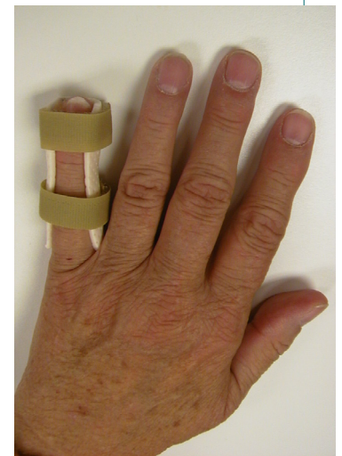
Example of a finger-protection orthosis for a volar plate injury

Most volar plate injuries can be treated without surgery. A physical examination and X-rays may be taken. Treatment may consist of a short period of protection by wearing an orthosis and early exercise. If the volar plate injury is not stable, surgery might be required.