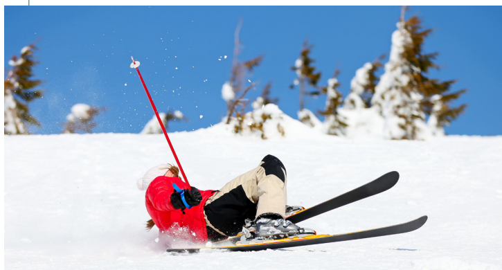
Holding a pole during a fall can cause a skier's thumb injury.

Most often, injuries occur during sport or recreational activities, such as skiing, football, biking and soccer. Any extreme force to the thumb in the opposite direction can cause a sprain or strain, but injuries can also occur as a result of a fall, or jamming the thumb.