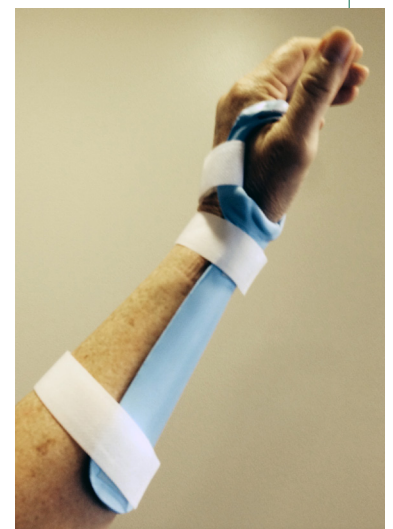
Orthosis for tennis elbow to help rest the affected area

A hand therapist can provide conservative management for the treatment of tennis elbow, with the goal to return the patient back to normal work, home and sports activities. A therapist can help identify what activities might aggravate symptoms, and discuss activity modifications. A custom-fabricated brace or orthosis for the wrist might be recommended to rest the area. Various treatments can be utilized, such as heat, ice, ultrasound, massage or electrical stimulation. The therapist will often prescribe stretching and strengthening exercises. Following any surgery for tennis elbow, therapy is important to regain motion and strength.