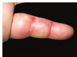
Finger fracture with swelling and bruising

Fractures can cause pain, throbbing, swelling and bruising, and the finger might look deformed or out of place. There will also be limited motion or inability to move the fractured finger and also the other fingers. There might be some numbness