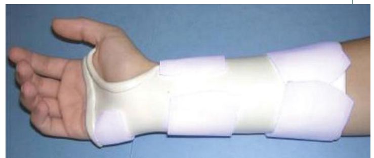
Custom-made orthosis to limit motion in a wrist with a ganglion cyst

A hand therapist will help determine which activities should be avoided. A hand therapist may also make a custom orthosis to limit joint motion. If surgery is performed, treatment will include exercises to restore the range of motion, strength and function of the hand. Other treatments may also be used to help manage pain and scarring.