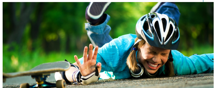
Example of a fall on an outstretched hand or wrist called a FOOSH

A distal radius fracture is usually caused by a fall on an outstretched hand or through contact sports and physical activities. Bones make up our rigid skeleton, and when a lot of force is put through them, they can break. A number of risk factors, such as low bone density or osteoporosis, may make it more likely for a distal radius fracture to occur.