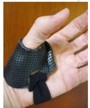
Orthosis for CMC arthritis

Initially, a hand therapist can provide patient education including use of adaptive equipment, activity modification and special exercises to help reduce pain. A hand therapist can also provide a custom-fabricated brace or orthosis that will allow the thumb joint to rest and will provide support while performing daily activities. Hand therapy following surgery improves range of motion, and teaches the patient how to regain the function of the hand.